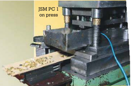
JSM PC 1 on press