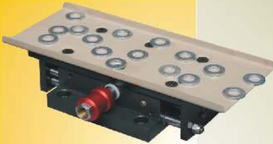
JSM PC 1