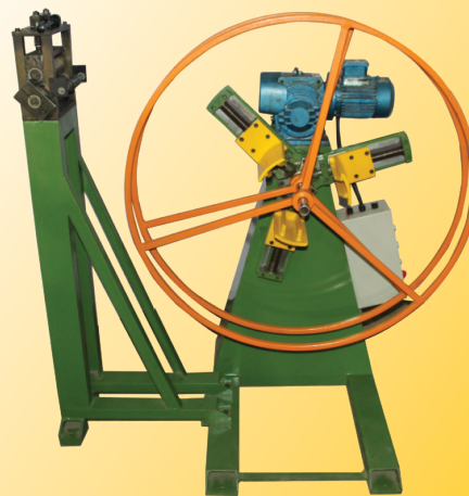
Motorised Recoiler With Winding Arrangement VD - 5