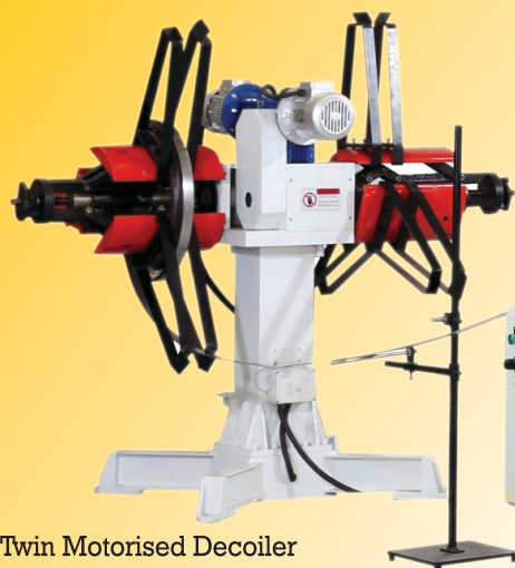
Twin Motorised Decoiler TD - 10