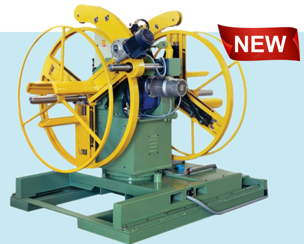
Dual Decoiler along with Hydraulic Jaw Expansion, Holddown and Disc Breaking Arrangement for 60 MPM line speed MDD-3000