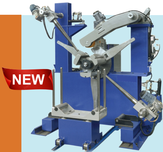
Motorised Decoiler along with Hydraulic Wedge Type Jaw Expansion, Holddown, Width Guides, Motorised Traverse Arrangement & Coil Car MD-3000

High Quality Products for Coil Feeding in Press Room