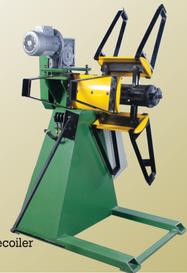
Motorised Decoiler VD - 10