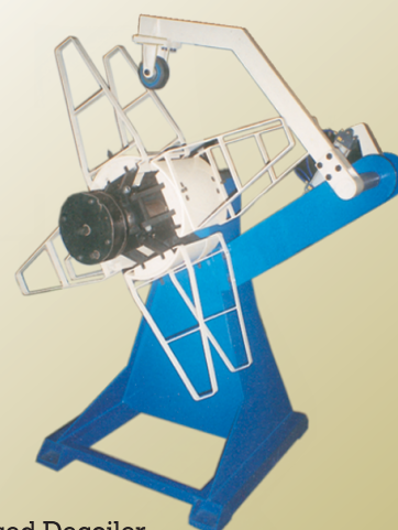
Motorised Decoiler With Pneumatic Hold - Down VD - 25