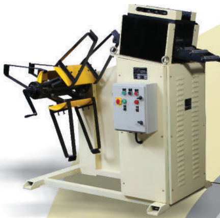
Compact Unit CPSD-1000-300-65-7