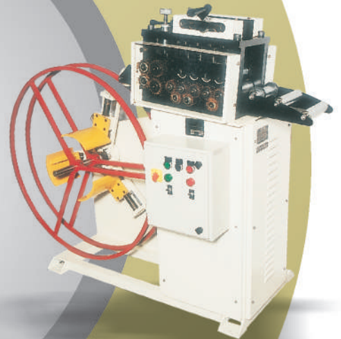
Compact Unit CPSD-500-150-50-9