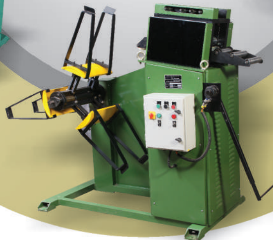
Compact Unit CPSD-1000-300-65-7