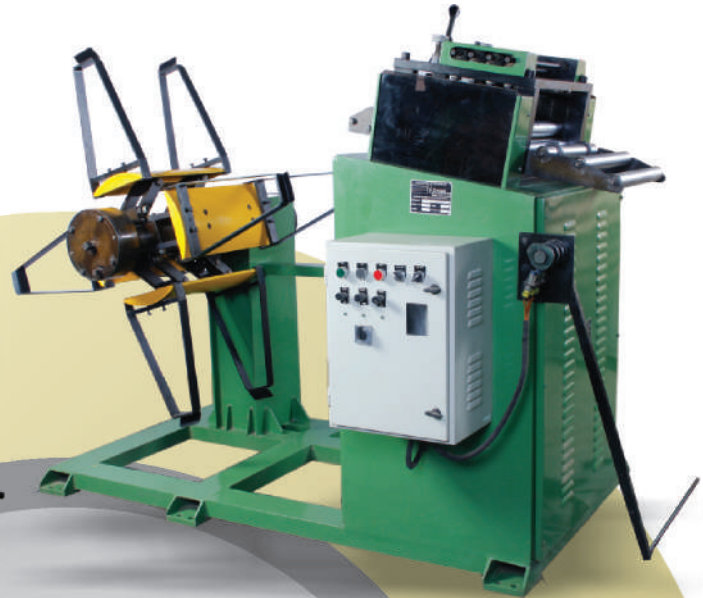
Compact Unit CPSD-2500-400-65-7