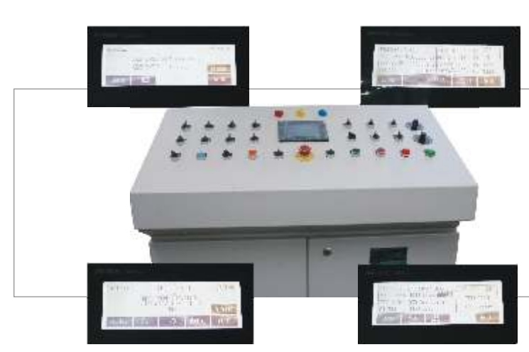
Control Panel with Touch Screen Programming for simplicity in Parameters feeding

The above parameters are for the material having tensile strength 40kgf/mm² max. Models of higher capacity or higher or lower line speeds are available on request.