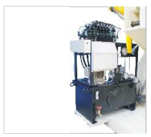
Hydraulics and Valve Arrangement