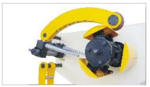
Snubber, Width Guide, Roller Support