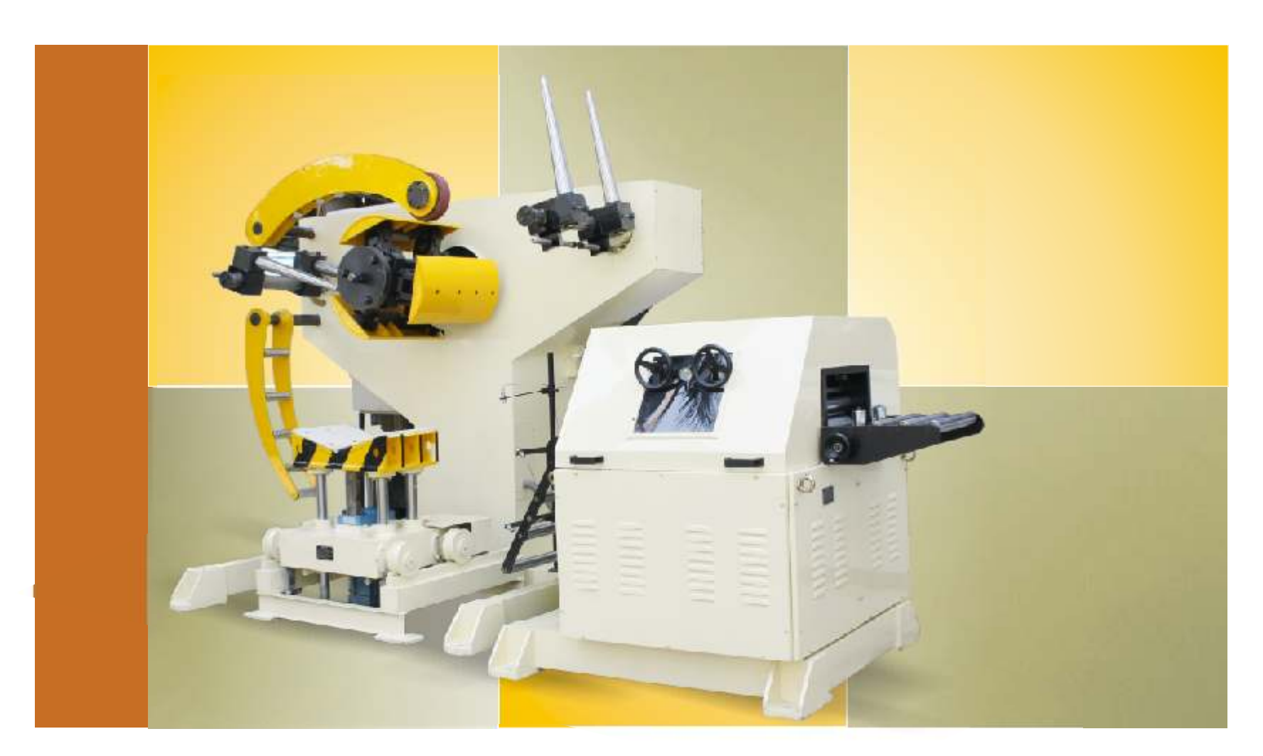
Total Feeding Solu

High Quality Product for Coil-Feeding in Press-Room