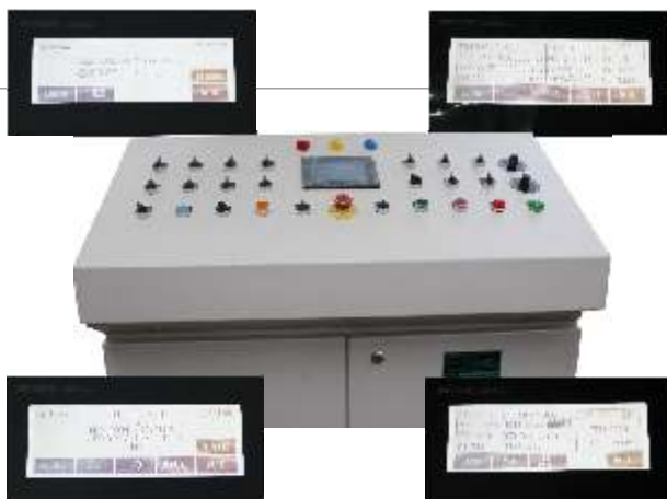
Control Panel with Touch Screen Programming for simplicity in Parameters feeding

The speeds in feeding table may vary by the load to feeding machine by material stress etc.