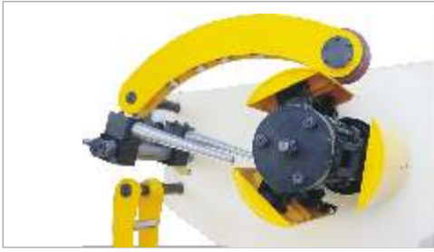
Snubber, Width Guide, Roller Support