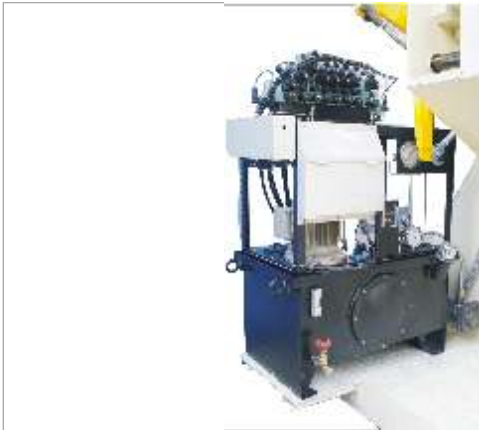
Hydraulics and Valve Arrangement