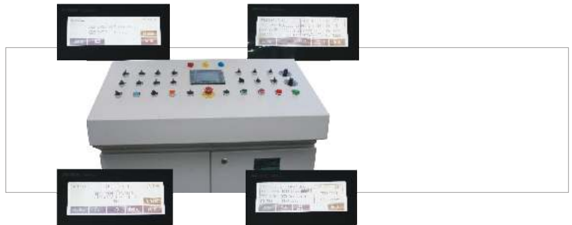
Control Panel with Touch Screen Programming for simplicity in Parameters feeding

The above parameters are for the material having tensile strength 40kgf/mm 2 max. Models of higher capacity or higher or lower line speeds are available on request.